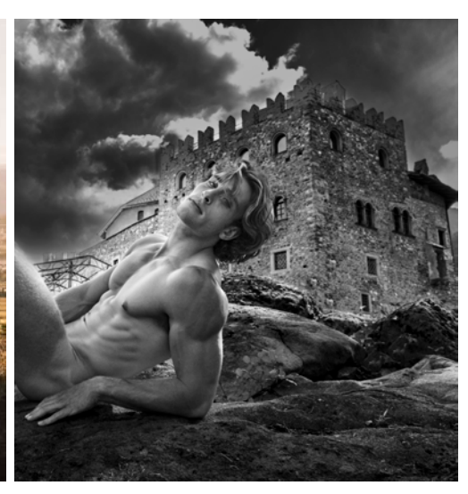
Alios Lageder Monastery