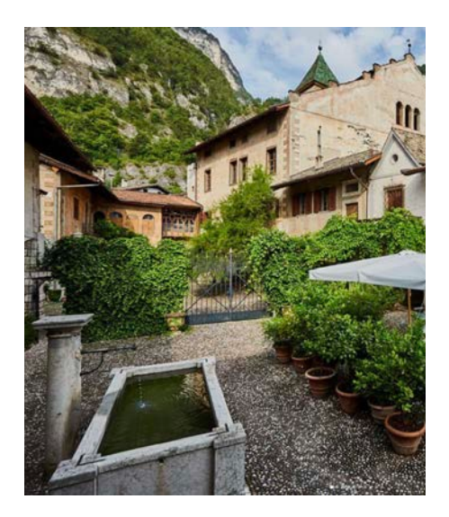
Rauchhutte Seiser Restaurant